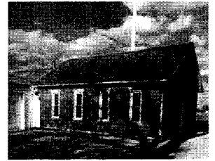
Township hall located on the corner of DeCliff-Big Island Road & Bumford Road